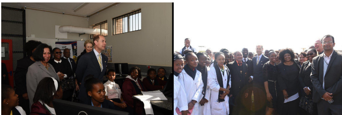
Royal Highness Prince Edward interacting with learners, UJ Science Faculty personnel and SAIP representatives at the Soweto Science Centre.

University of Witwatersrand, South Africa